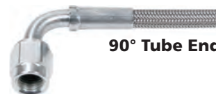
90° Tube End