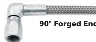
90° Forged End